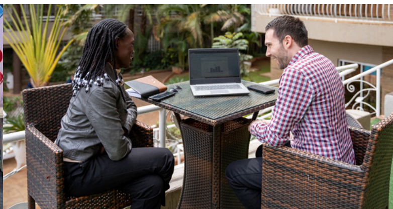
Leaders of Africa Institute Scholars and Alumni